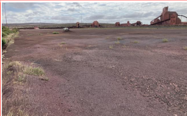
Figure 2: South warehouse location