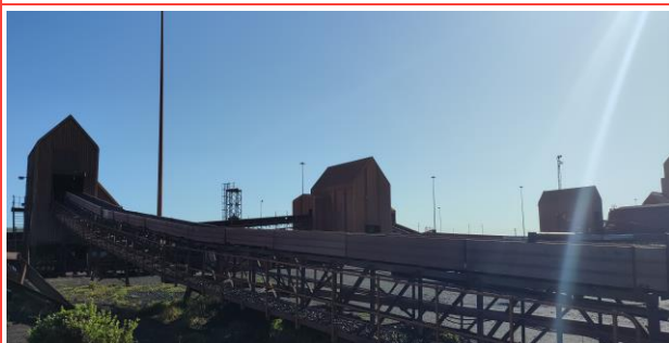
Figure 2: Existing conveyance system