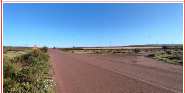
Figure 3: Haul road weighbridge access