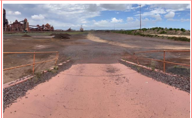
Figure 3: North warehouse location