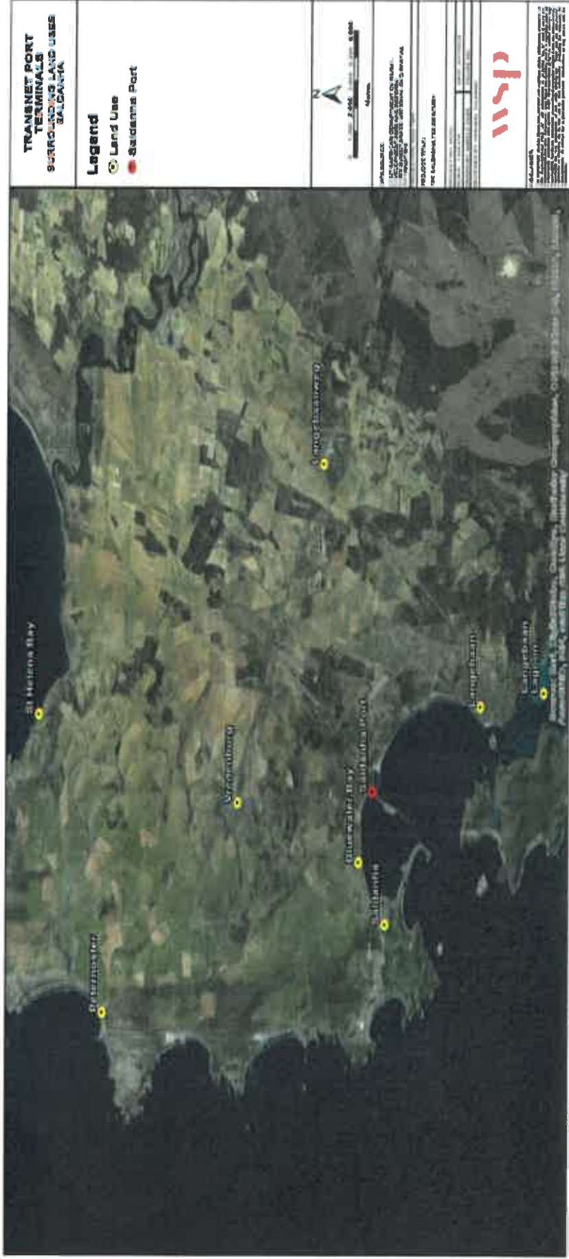
Figure 1: Surrounding area of Transnet Port Terminals.

Department: Environmental Affairs REPUBLIC OF SOUTH AFRICA