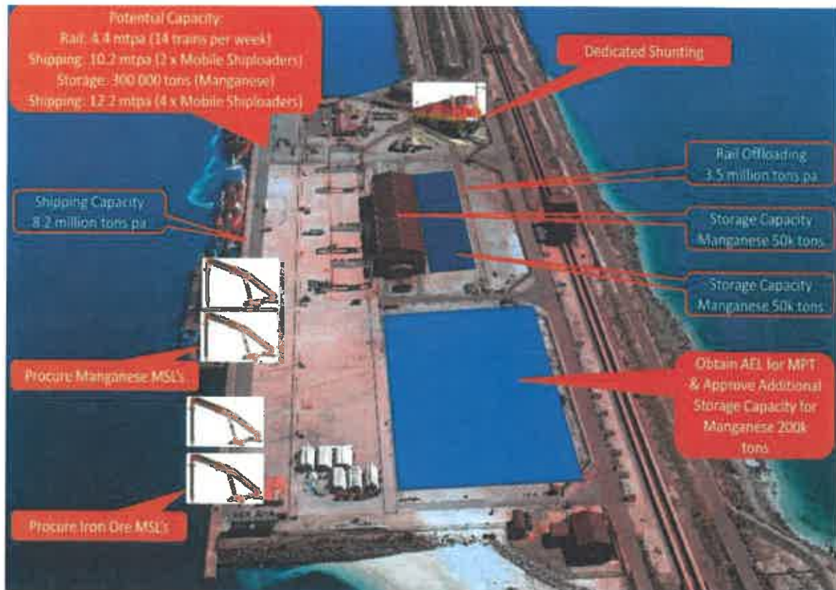
Figure 2: Simplified diagram for Transnet Port Terminals.

The MPT currently has sufficient space to store 90,000 tons of ore in two storage sheds and propose to store a further and 200,000 tons of ore in an open stockpile along the quayside. Manganese is to enter the terminal via rail and stored in the two warehouses as well as in the open stockpile area. Product is to then be loaded into skips and transported to the quayside for vessel loading. Figure 2 below shows the proposed layout of the MPT and capacity of the terminals infrastructure.