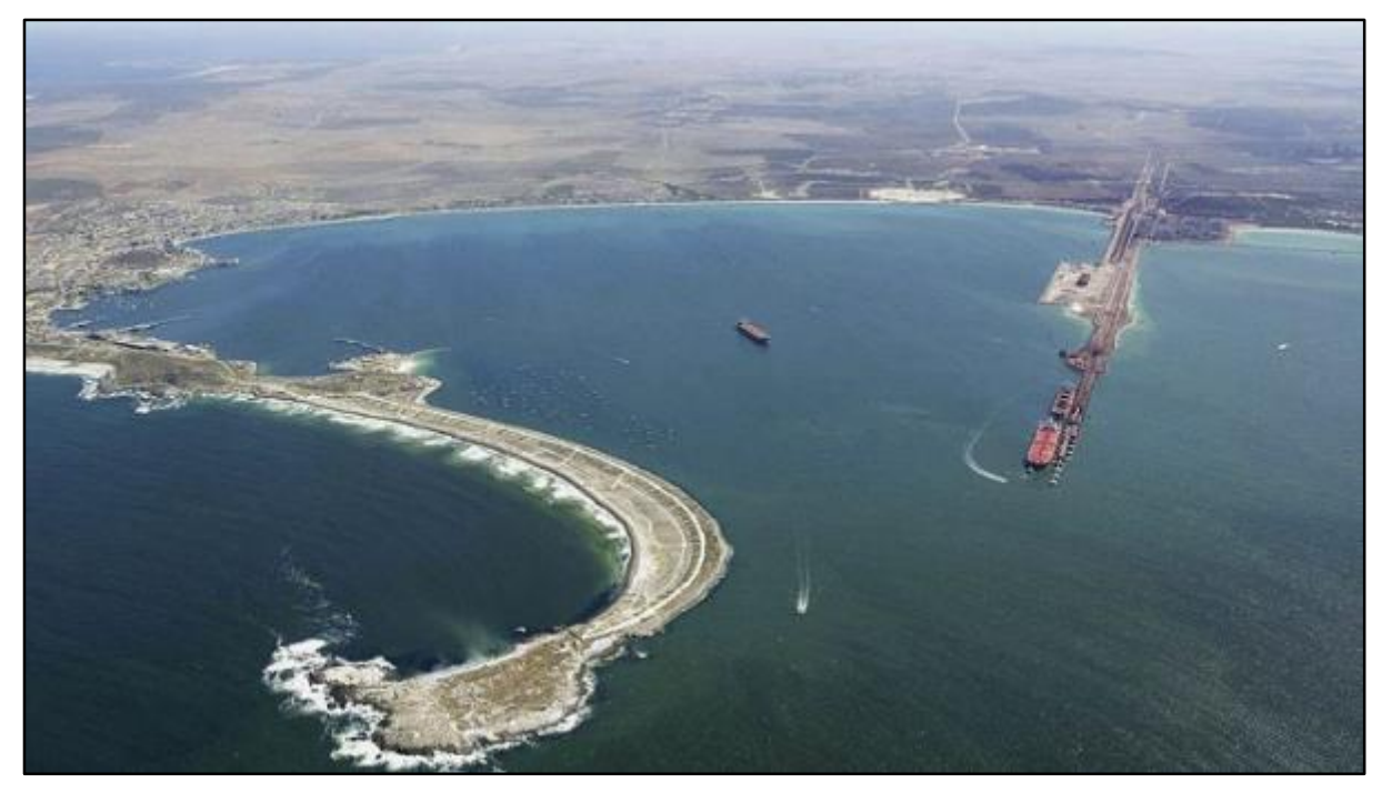
Figure 1: Aerial image showing an overview of the Port of Saldanha Bay.

The proposed project is of national strategic importance as it forms part of National Government's intent to address the energy crisis in South Africa. The Port of Saldanha Bay was identified as a preferred location in this region as it meets the specifications for the proposed powership project and occurs within a designated Strategic Economic Zone (SEZ) (Figure 1 and 2 below).