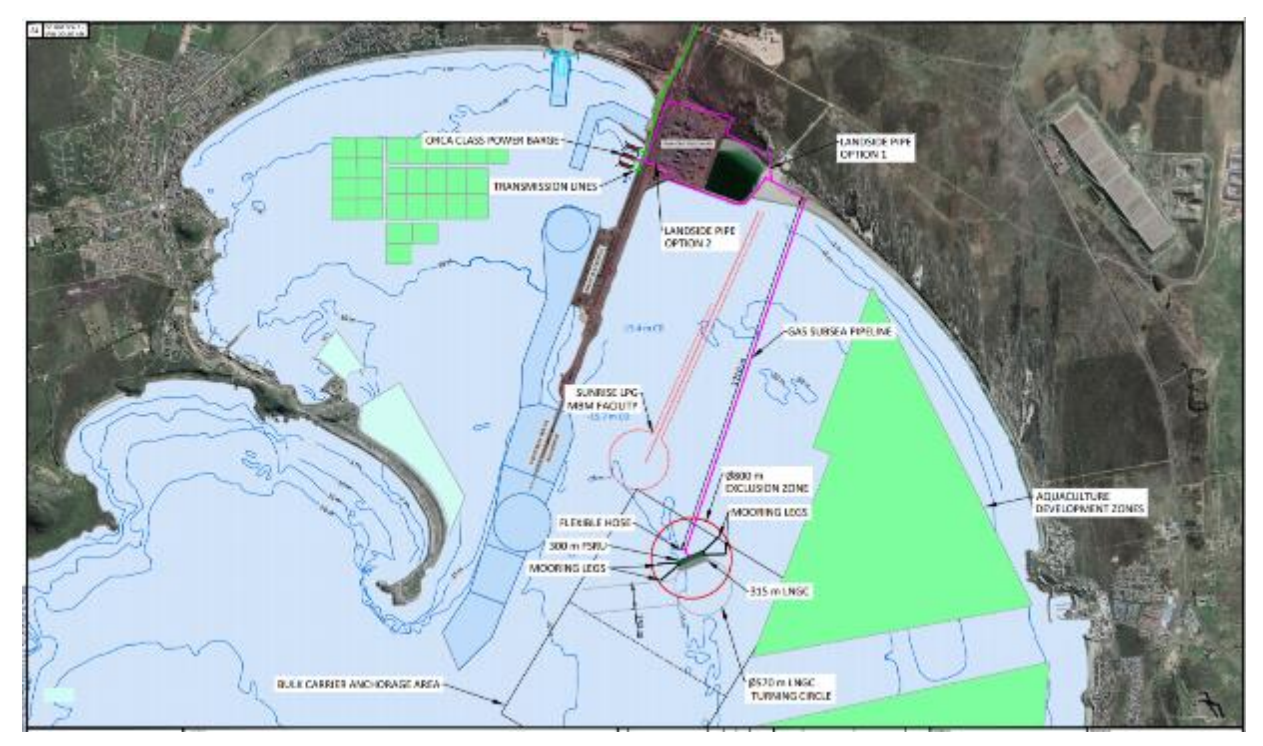
Figure 2: Preferred Location