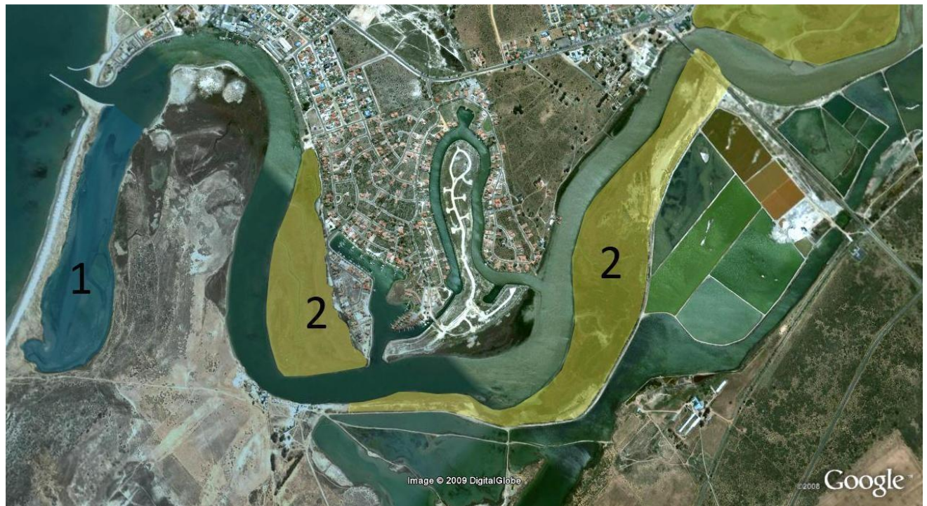
Special features and habitats on the Groot Berg River estuary for which additional protection is required. 1. Old Mouth Lagoon, 2. Intertidal salt marshes.