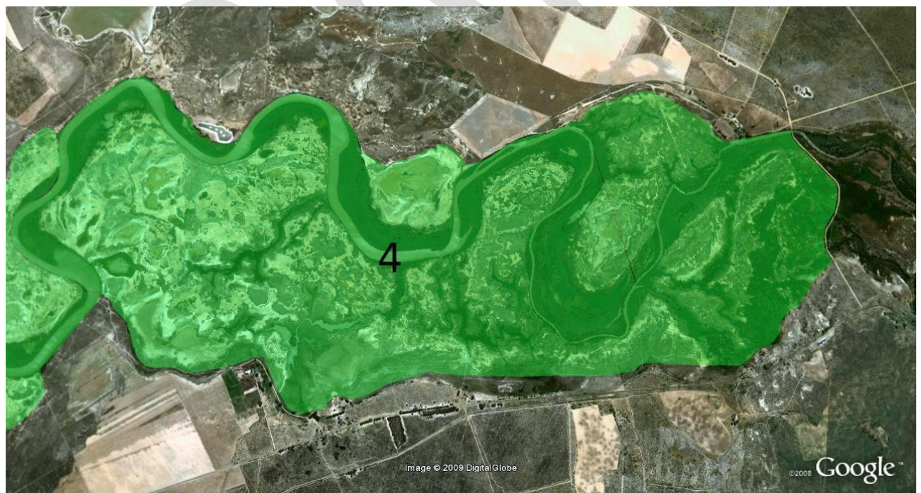
Zone 4 as far as is applicable to the Bergrivier municipal area